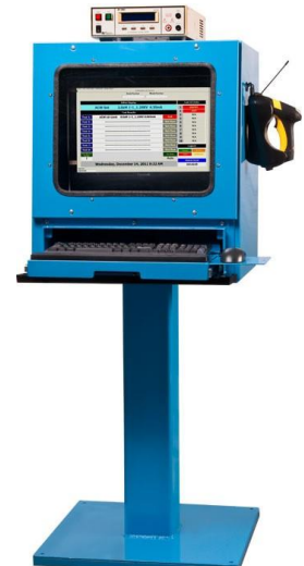
DataServ HiPot Test Station