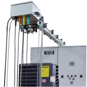
Test Connector Panel Mounted on Rotating Boom