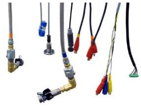
Test Connector Tooling