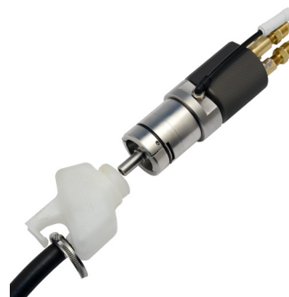
Single Port, Dripless, Auto Clamping and Sealing Fill Tool