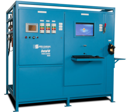
DataFill Brake System Base Station