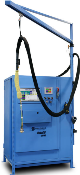
DataFill Brake Fill System with Pivoting Boom Tool Presentation