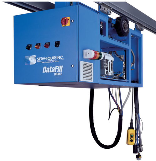
DataFill Brake Fill System