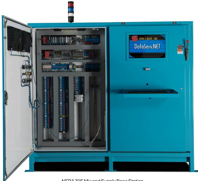
NFPA 70E Mix and Supply Base Station